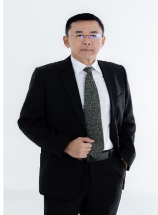
Pol.Maj.Gen. Prapass Piyamomgkol